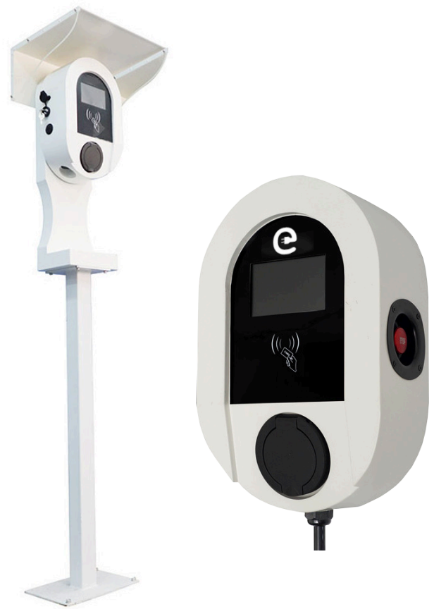
Wall mounted or floor mounted using a pedestal